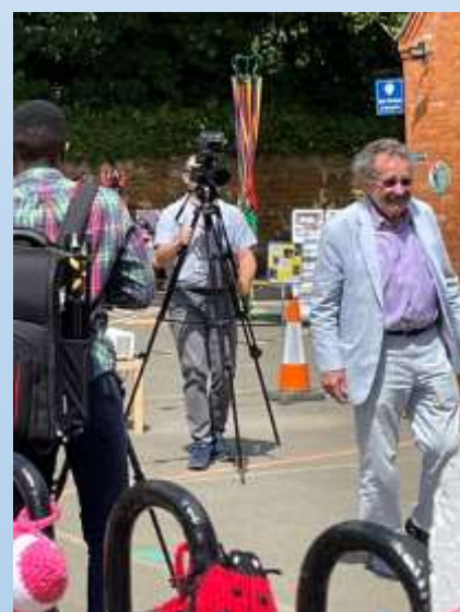
Professor Lord Robert Winston

The older pupils designed their own First World War memorial to all the young men from Spratton, killed in the war, who had attended the primary school.