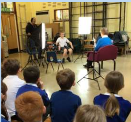
Members of the history society were interviewed