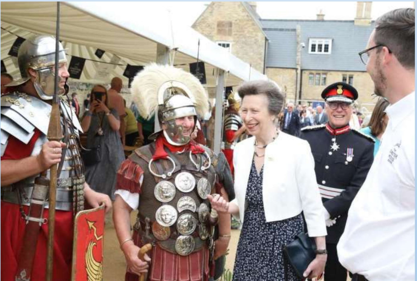
HRH The Princess Royal at Chester House Estate