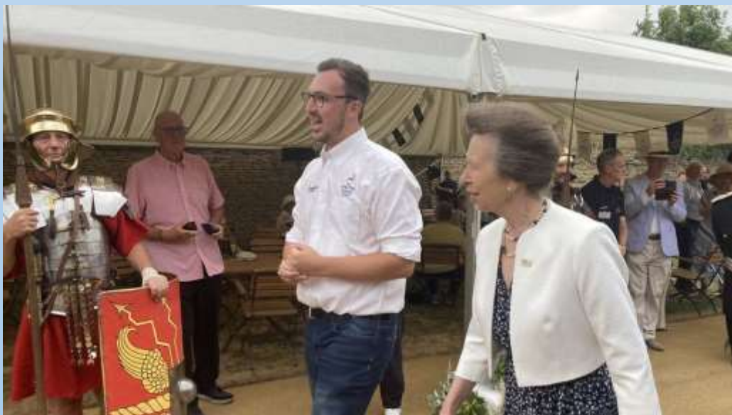
HRH The Princes Royal at Chester House Estate