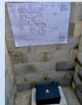
Shoebox in situ