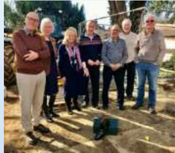
A group of Trustees gather at shoebox/ time capsule burial